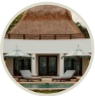
Maroma, A Belmond Hotel, Riviera Maya